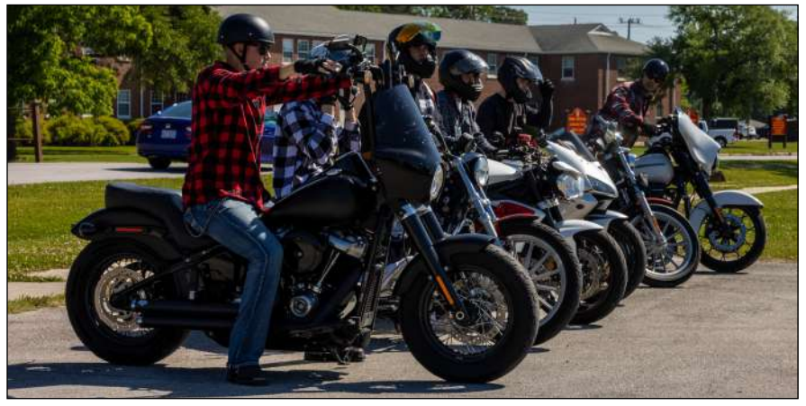
U.S. Marines with 2d Marine Division (MARDIV) participate in a motorcycle awareness event on Camp Lejeune, North Carolina, April 21, 2023.